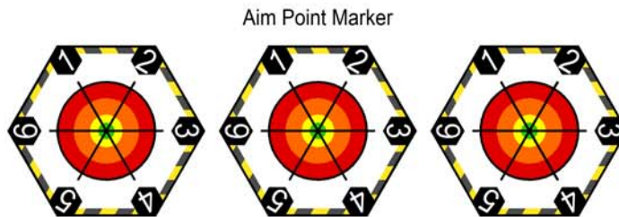
Aim Point Marker

Draw in Campaign Cartographer 3. Based on graphics from Dream Pod 9 (c) 2008. Used with permission from Dream Pod 9.