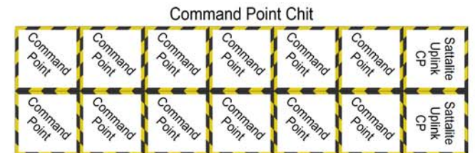
Command Point Chit