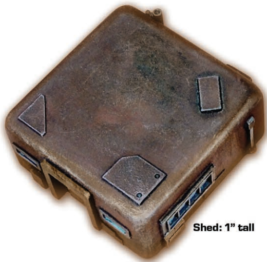
Shed: 1" tall