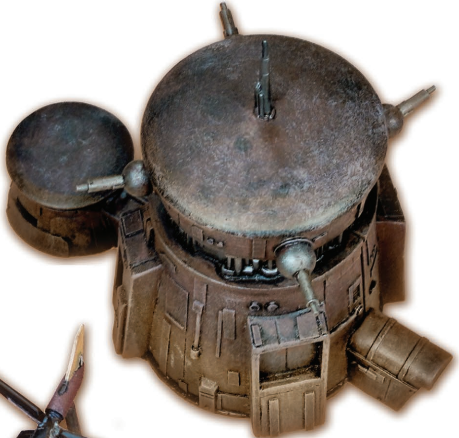
Outpost: 3" tall