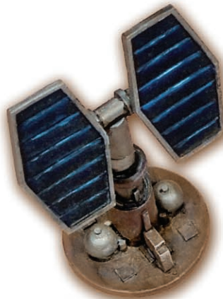
Solar Panel: 2" tall