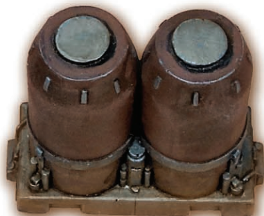
Water Tanks: 1.5" tall