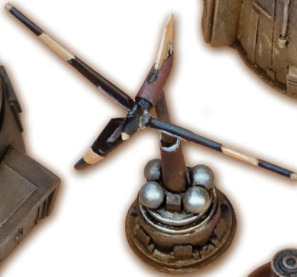
Windmill: 2.5" tall