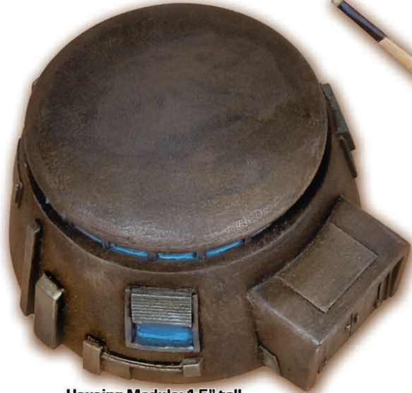
Housing Module: 1.5" tall