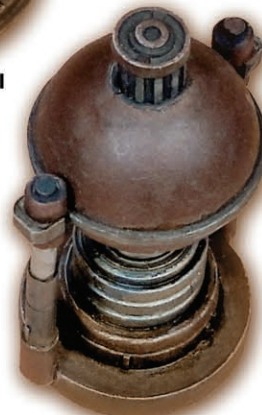
Condenser: 2" tall