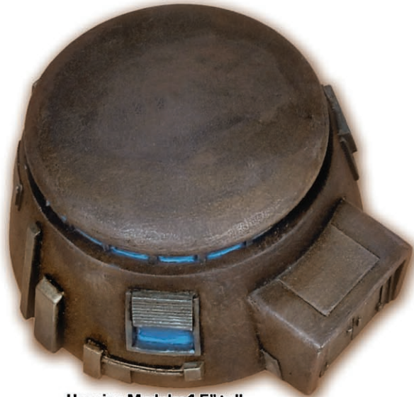
Housing Module: 1.5" tall