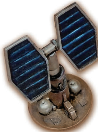
Solar Panel: 2" tall