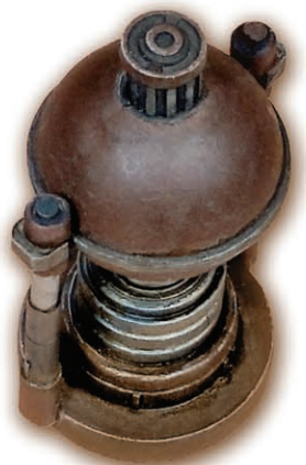
Condenser: 2" tall